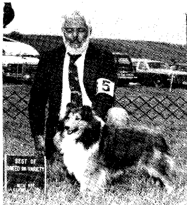
NEW CH. CHENTERRA DUSTIN III ROAD, C.D. (Ch. Chenterra Yankee Tradition X Chenterra Sophistication)

Dustin was owner handled to his championship and C.D. Along the way he was a specialty winner and also a group winner.